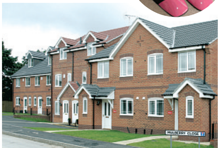
■ The exterior view of the homes at Meadow Bank on Baums Lane.